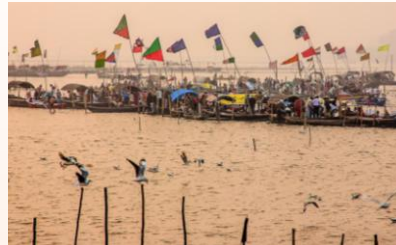
'Sangam' at Allahabad