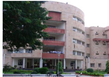
Administrative Building, MNNIT