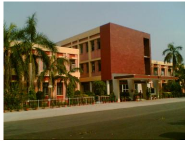
Academic Building, MNNIT