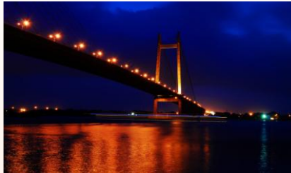
New Yamuna Bridge at Allahabad